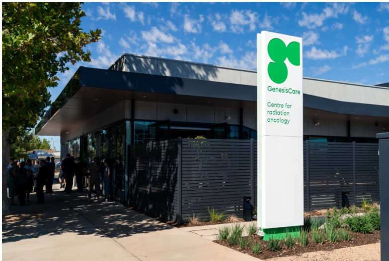
Photo caption: Brainlab receives large investment in ExacTrac Dynamic systems from GenesisCare